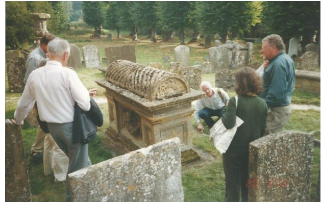
The group outside Old Fleet Church and Meade Falkner's 'Bale' tomb