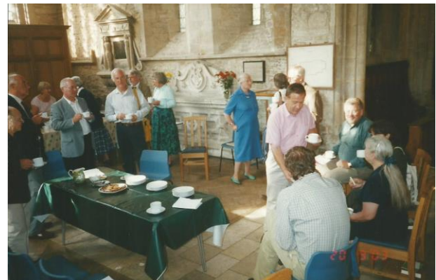
Tea with the Friends of Burford Church